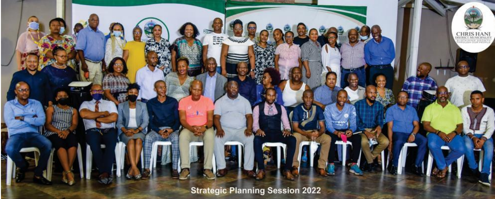
Strategic Planning Session 2022