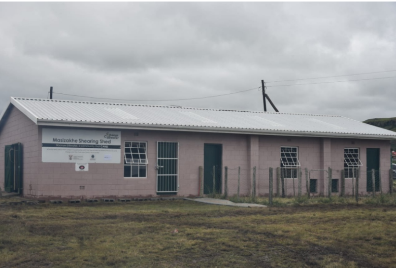
New Shearing Shed