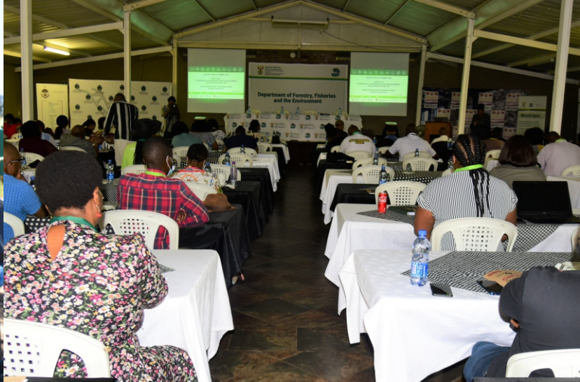
Delegates during the summit